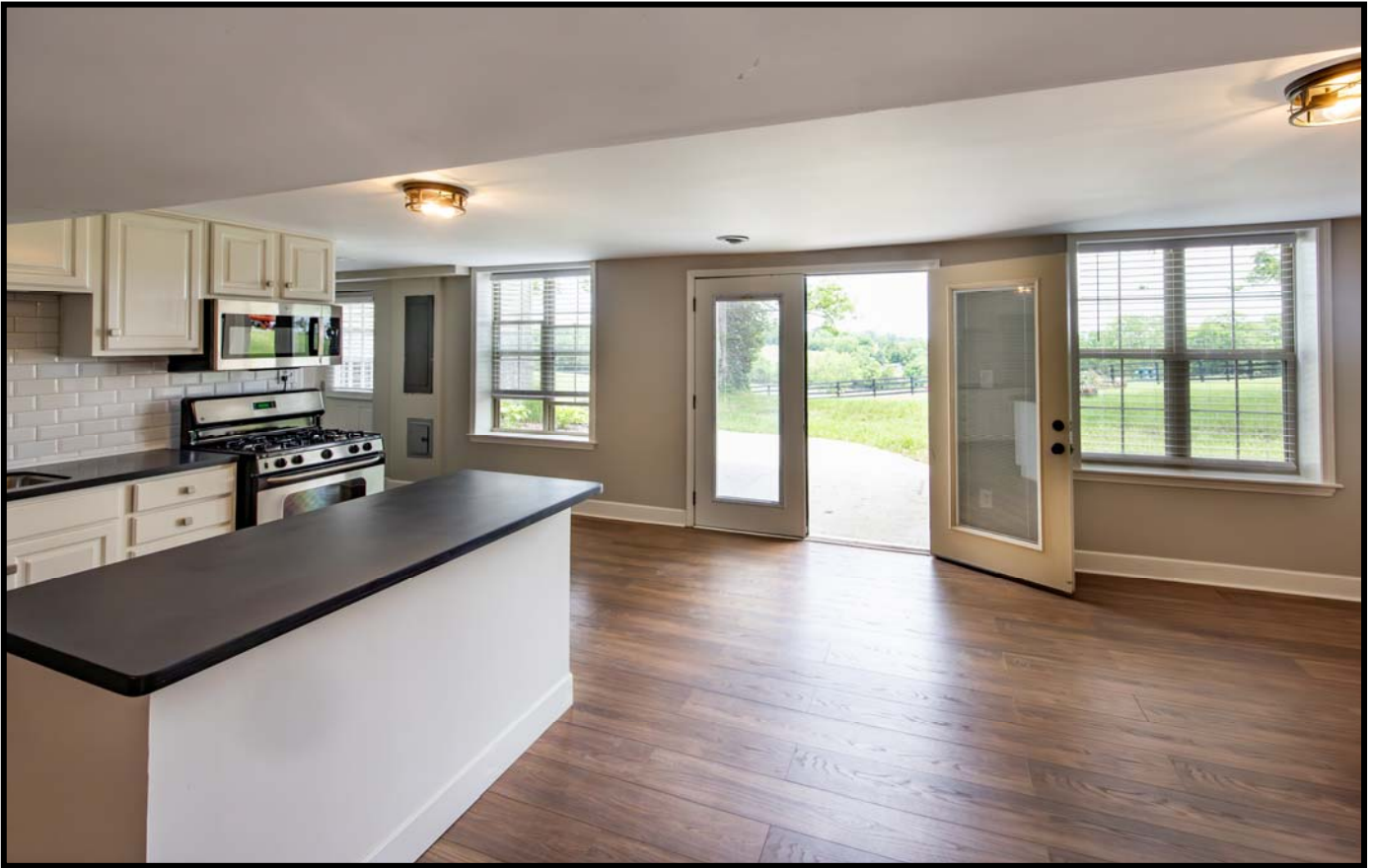
Lower Level Apartment with recreation room & fireplace, bedroom, full bath, and separate entrance.