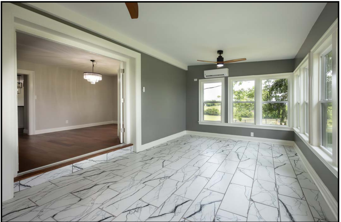
Year around sun porch off of dining room: 19' x 11' 5"