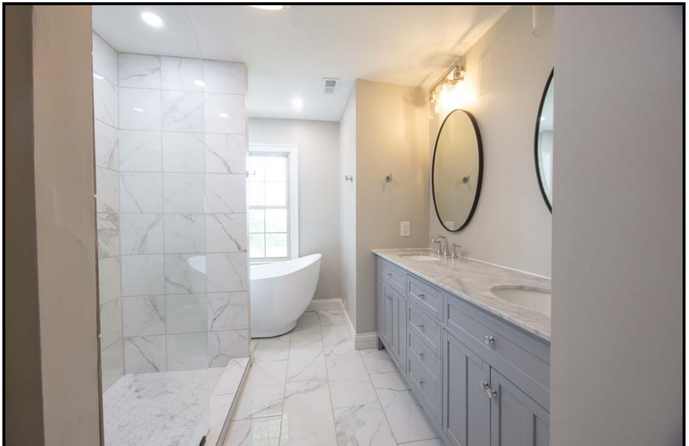
2nd floor primary bath with double sinks, tile floor, walk-in shower, and soaking tub