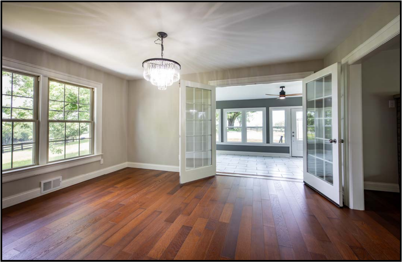
Dining Room: 15' x 21' 8"