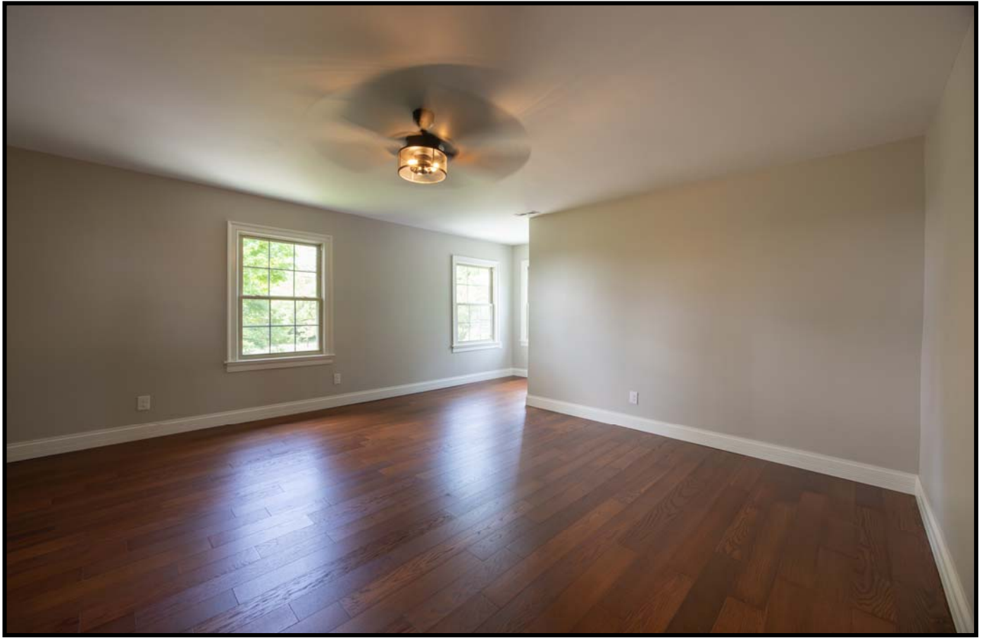
2nd floor bedroom: 14' 7" x 12' 2nd floor bath with tiled bath and shower