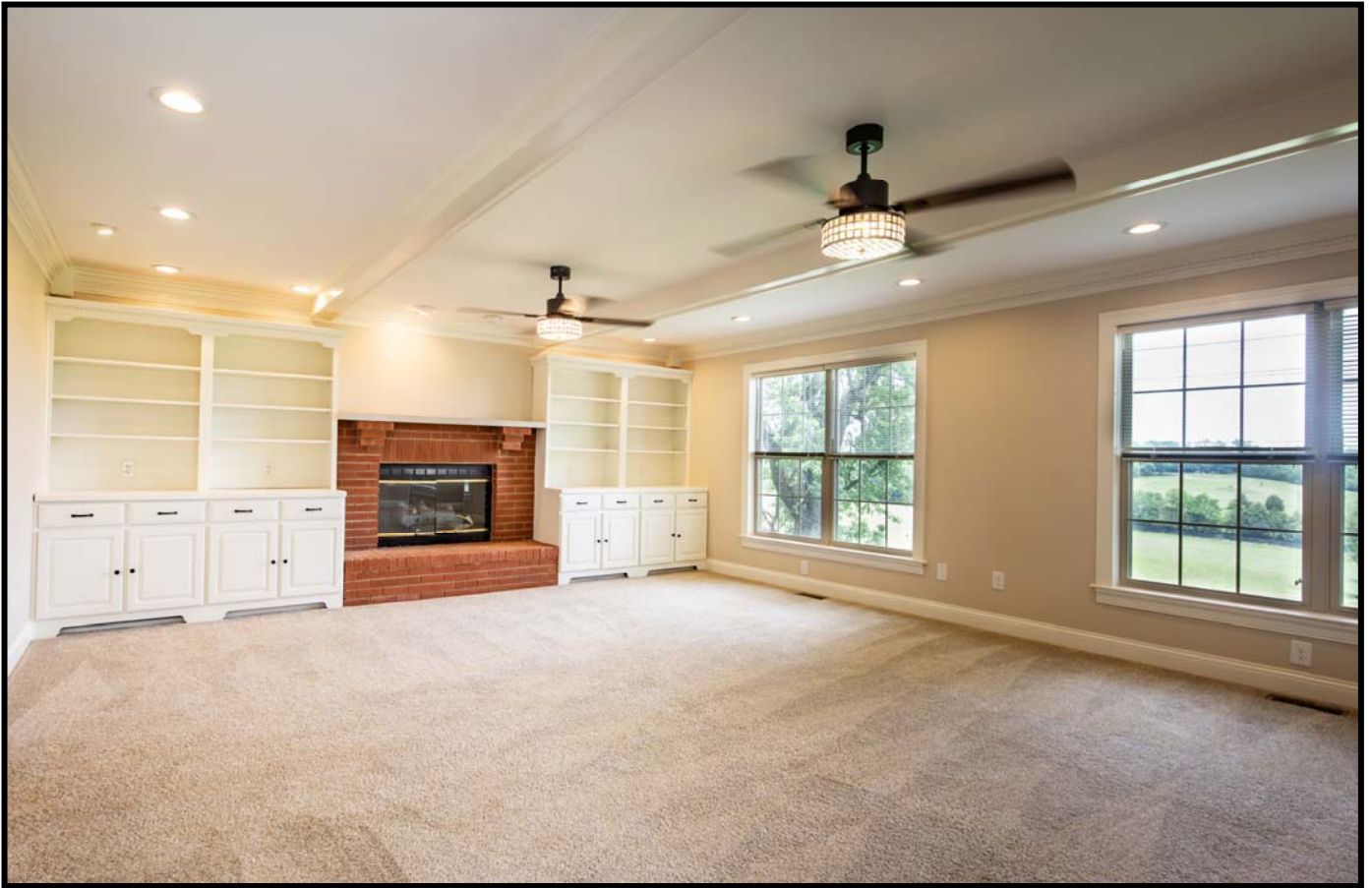
1st floor primary suite or family room with gas log fireplace: 18'3" x 22' 1st floor primary bath with double sinks, tile floor, walk-in shower, and soaking tub