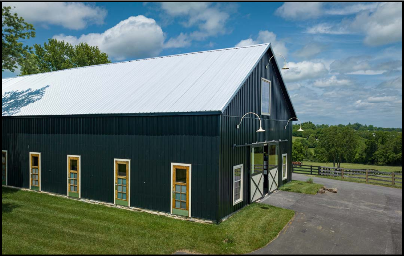
12 stall barn with hand hewn cherry tongue & groove paneling; exterior doors; blacktop aisle; limestone faced office w/ full bath, w/d, refrigerator, feed and wash room.