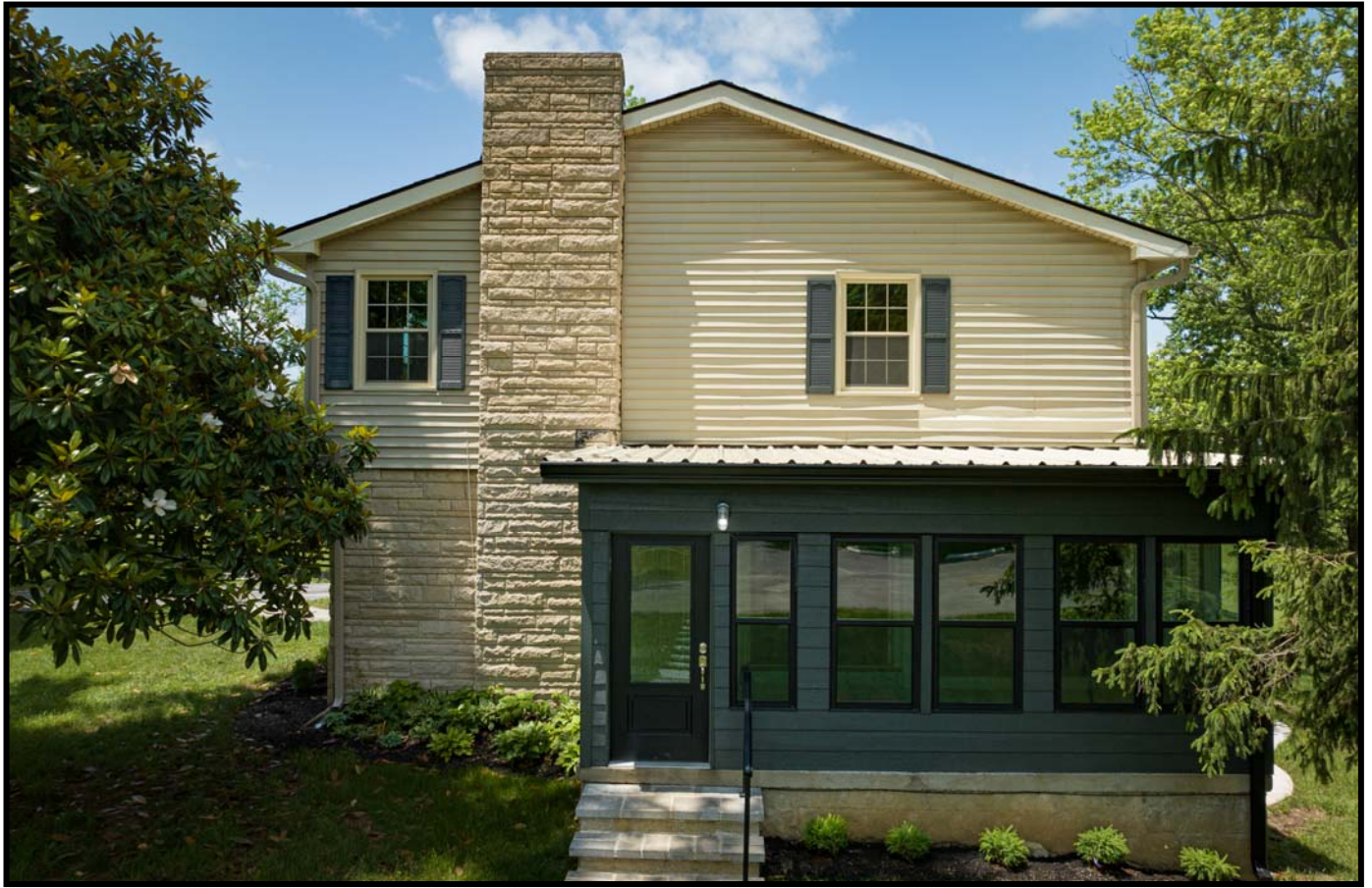
Sun Porch: 19' x 11'5"