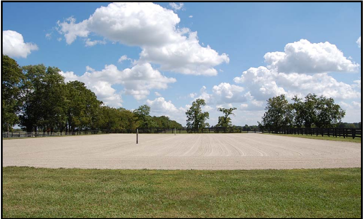
130' x 230' irrigated silicon sand base outdoor rings with 18" gravel base. Conveniently located for ease of use.