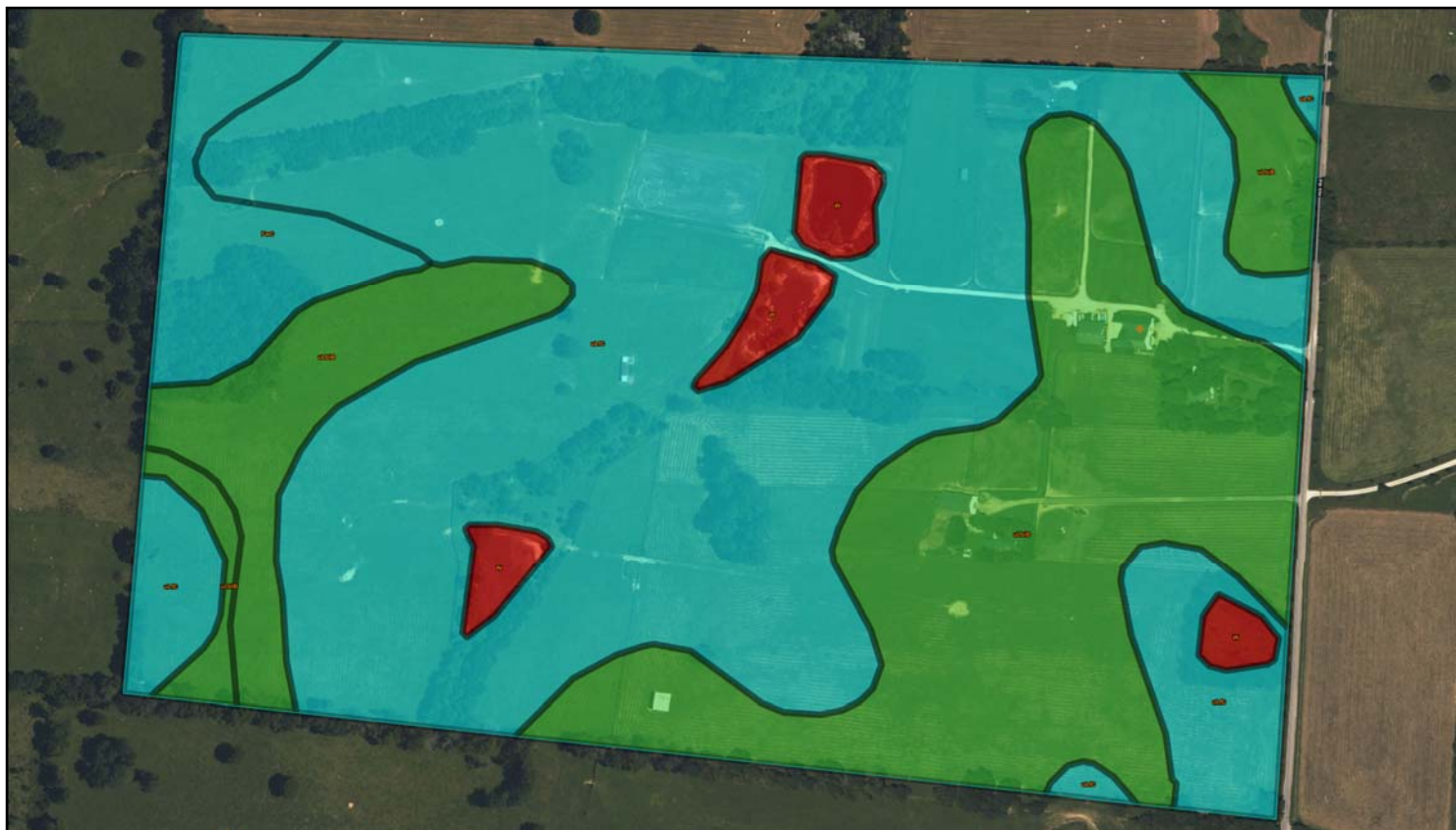
Tables — Farmland Classification — Summary By Map Unit