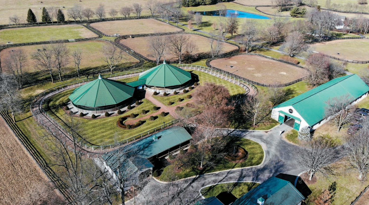
True 'turn-key' operations, ones that require little refurbishing or building, are highly sought after