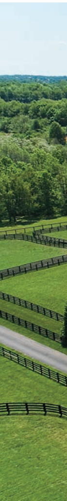
Left: Nydrie Stud in Virginia offers a sizable farm and historic buildings; right, several supersized properties are on the market in Central Kentucky