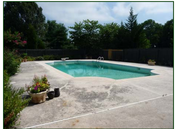
Pool (20' x 39') : Gunite, walk-in steps, maintained by True Blue Pools